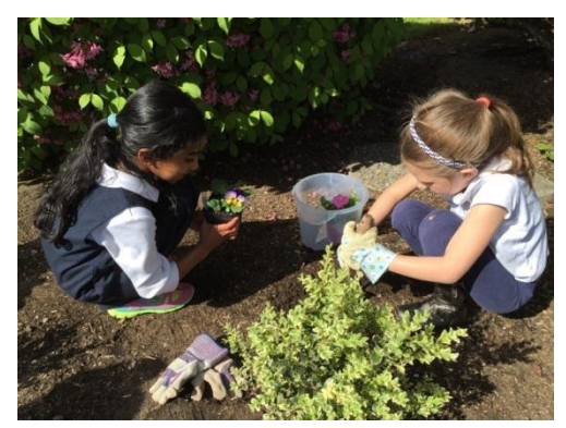
#3: We brought food in reusable & recyclable containers for a litter free lunch

#2: We planted annuals & perennials in our school gardens