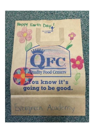
#4: We decorated grocery bags to educate the community about Earth Day