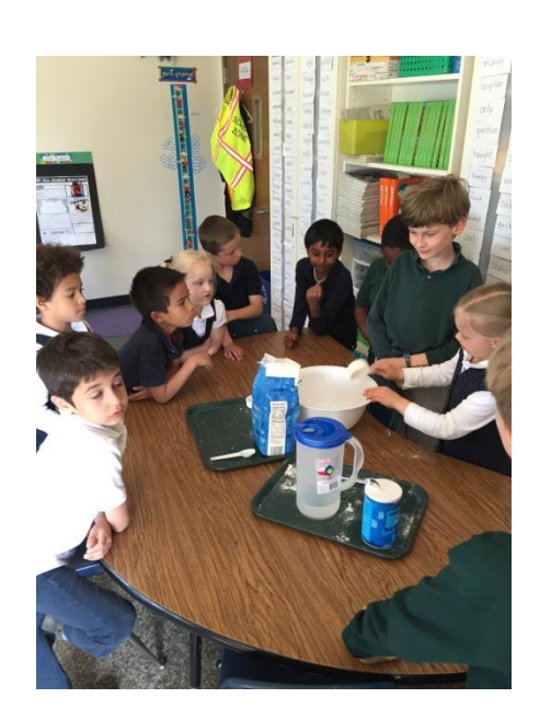
#1: We turned off the lights to conserve energy

#2: We planted annuals & perennials in our school gardens