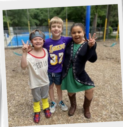
Creating Lifelong Friendships