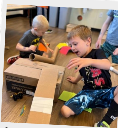
Sculpting Imagination into Reality