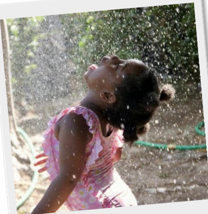
Carefree Summer Bliss

Apply sunscreen to your child prior to coming to camp and provide a hat they may wear during outside play time (please label the hat with your child's name).